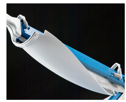
Revolutionary safety guard rotates around the blade throughout the entire cutting process.