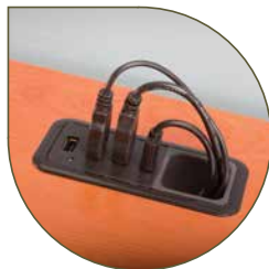
4 port USB Hub