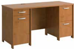
Double Pedestal Desk 57.99"W x 23.19"D x 30.2"H (HC) PR76560K (NC) PR76360K (MR) PR76860K