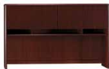
Credenza Hutch 59.38"W x 11.63"D x 36.63"H (CS) EX17713 (DO) EX17513