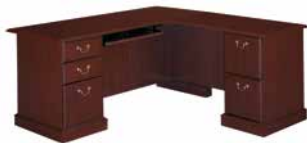
L-Desk 66.13"W x 71.13"D x 30.75"H (CS) EX45670