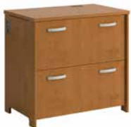
Lateral File 31.97"W x 20"D x 30.2"H (HC) PR76554 (NC) PR76354 (MR) PR76854