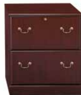
Lateral File 26.88"W x 19.38"D x 30.5"H (CS) EX45654

The refined elegance of timeless traditional styling makes Saratoga welcome in any office. The collection comes to life with a rich, pleasing cherry finish.