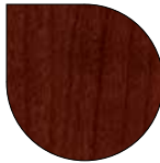
Harvest Cherry (CS)