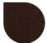
Mocha Cherry (MR)