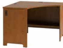
Corner Desk 42.01"W x 42.01"D x 30.2"H (HC) PR76520 (NC) PR76320 (MR) PR76820