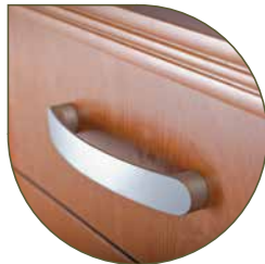
Stylish edge details