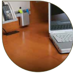
Durable work surface

The flexibility of the Envoy line provides for a range of workplace solutions. Envoy creates design integrity for small spaces, home or business offices or multi person work areas.