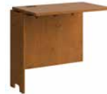
32"W Return 31.97"W x 20"D x 30.2"H (HC) PR76515 (NC) PR76315 (MR) PR76815