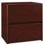
Lateral File 30.63"W x 19.63"D x 30.75"H (CS) EX17781 (DO) EX17581