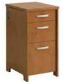
Three Drawer Pedestal 15.98"W x 20"D x 30.2"H (HC) PR76580 (NC) PR76380 (MR) PR76880