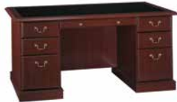
Manager's Desk 66.13"W x 29.5"D x 30.75"H (CS) EX45666