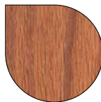
Dakota Oak (DO)

With its clean lines and rounded edges, the Northfield Collection offers design simplicity and styling to any decor.