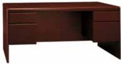
Double Pedestal Desk 66.63"W x 29.38"D x 30.75"H (CS) EX17718 (DO) EX17518