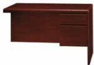
Return 49.63"W x 19.38"D x 30.75"H (CS) EX17710 (DO) EX17510