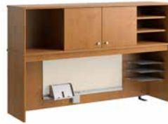
Hutch 57.99"W x 14.17"D x 36.14"H (HC) PR76561 (NC) PR76361 (MR) PR76861