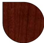
Harvest Cherry (CS)