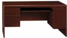
Credenza 61.63"W x 23.38"D x 30.75"H (CS) EX17712 (DO) EX17512K