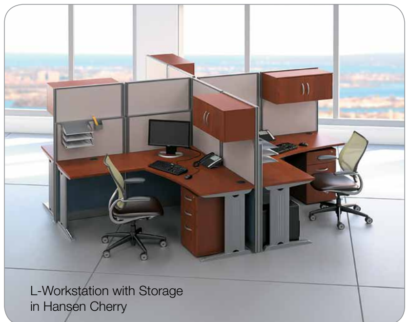
L-Workstation with Storage in Hansen Cherry