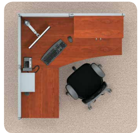
Layouts as compact as 6' x 6'