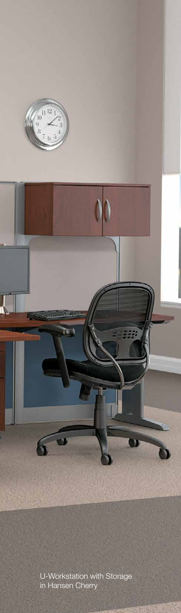
U-Workstation with Storage in Hansen Cherry