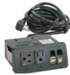
Data/Power HUB AC99840-03