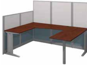
89" x 65" U-Workstation WCXXX96-03K