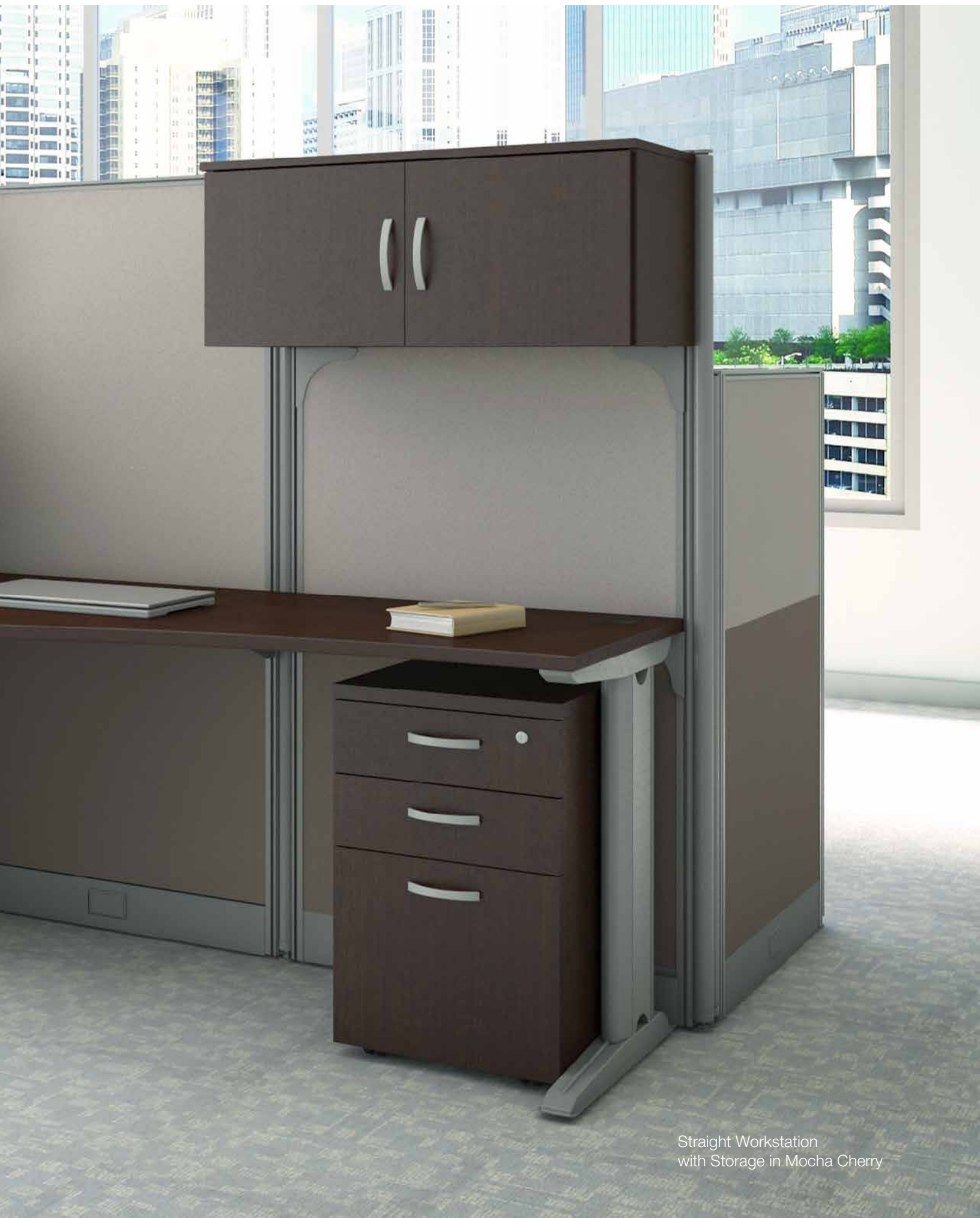
Straight Workstation with Storage in Mocha Cherry