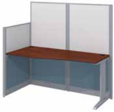
65" x 33" Straight Workstation WCXXX92-03K