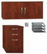
Storage/Accessory Kit WCXXX90-03