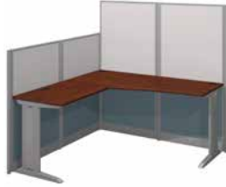
65" x 65" L-Workstation WCXXX94-03K