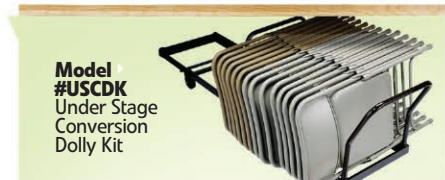
Model #USCDK Under Stage Conversion Dolly Kit

↗ 25.5" Height capacity with chairs loaded