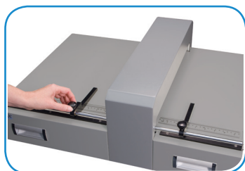
Adjust side guides