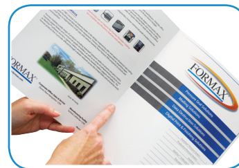
Sheet is creased and ready for crack-free folding