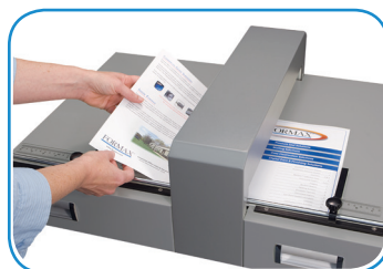
Load sheet to be creased