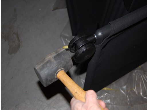
Step #6: Gently tap caster into position, set first and last panel aside.