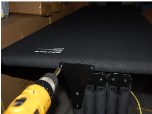
Step #10: Attach first and last panel to steel plate as shown.