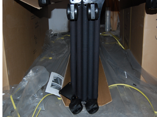
Step #7: Gently tap in remaining casters into partition assembly as shown.