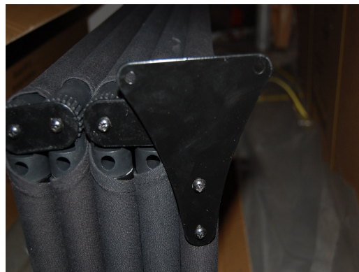
Step #9: Reattach steel plate as shown. Two on top, and two on bottom.