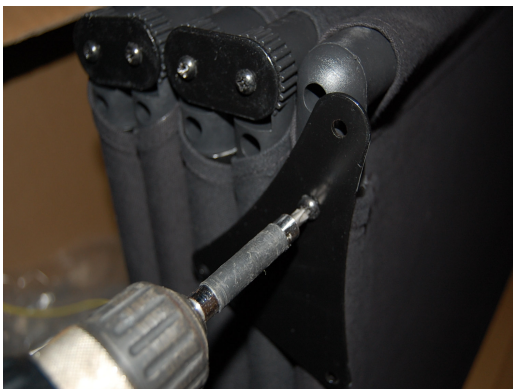
Step #8: Remove steel plate from partition assembly.