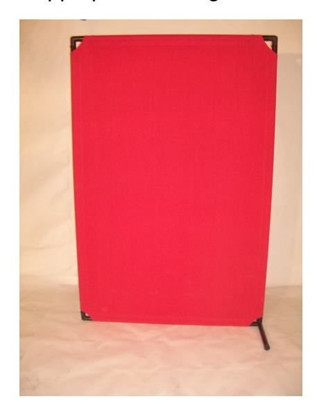
Step #9: Adjust joints as necessary to make sure partition is square.