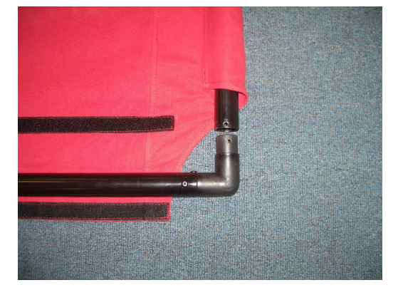
Step #5 Insert short bar with one corner bracket into the other long bar, this is bottom right.

Versare Portable Products 3306 5<sup>th</sup> street NE Minneapolis, MN 55418 Phone: 800-833-7570 Fax: 800-833-8032 WWW.PortablePartitions.com