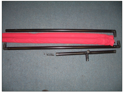
Step #1 Remove Items from box