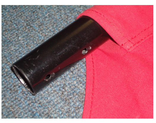
Step #3: Locate long bar with two holes is bottom left