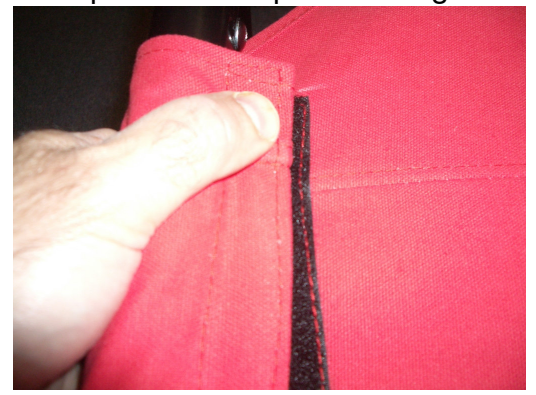
Step #8: Tighten the fabric on the top and bottom of the partition.