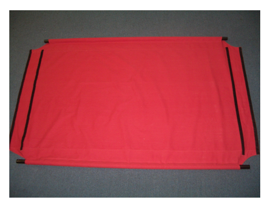
Step #2: Uncoil Fabric as Shown