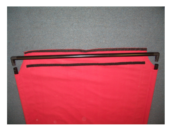
Step #6: Insert the short bar with two corner caps into the top of the long tubes.