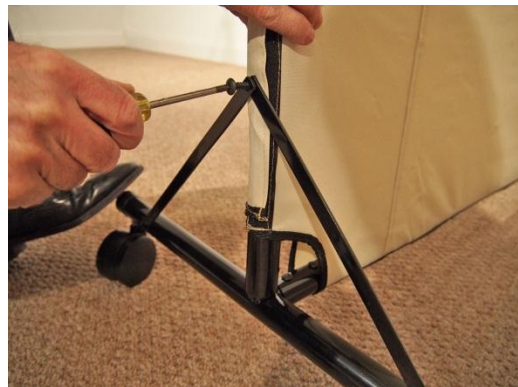
Step #11: Install support struts as shown above, repeat for opposite side.