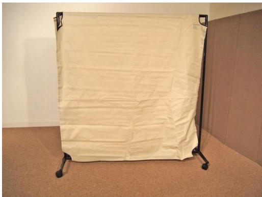
Step #10: Drape over partition panel, tension and hold in place with Velcro.