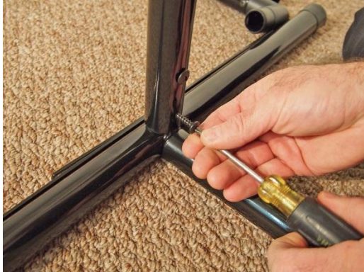
Step #6: Install screws, and repeat for opposite side.