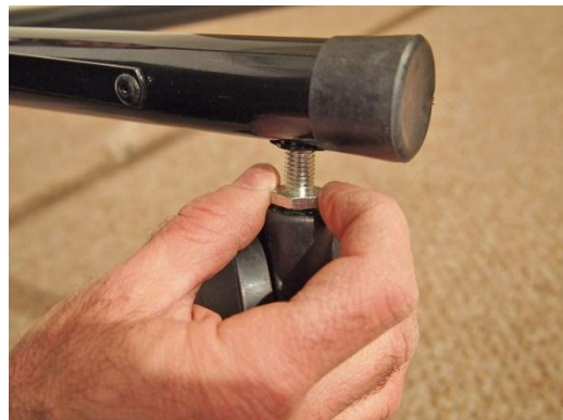
Step #9: Install 4 casters to the bottom of the caster base as shown, tighten with wench.