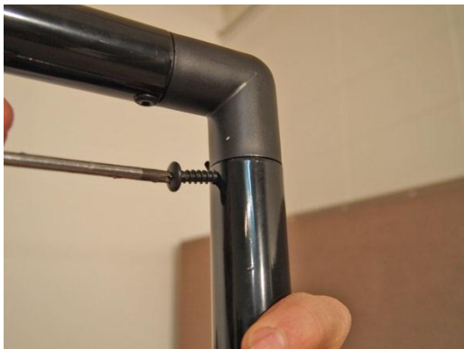
Step #8: Install screw as shown, repeat for opposite side..