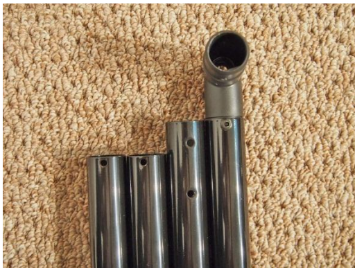
Step #2: There are 4 tubes, two equal length, one without plastic ends, one with.