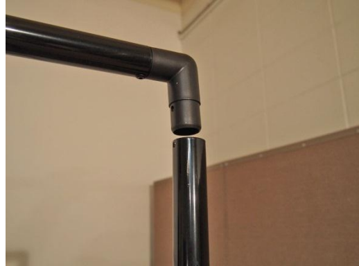
Step #7: Add tube with plastic ends to the two standing tubes as shown.