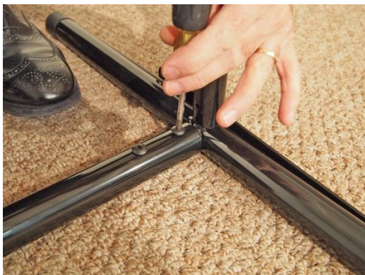
Step #4 Install screws as shown, repeat for opposite end.