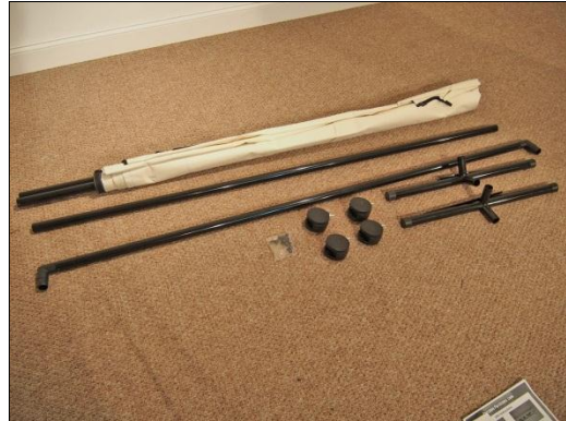
Step #1 Remove the Partition from the box.