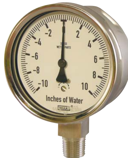
Capsule Element Pressure Gauge Model 632.50

Additional error when temperature changes from reference temperature of 68°F (20°C) ±0.6% for every 18°F (10°C) rising or falling. Percentage of span.