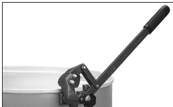
Step 3 – Figure 3