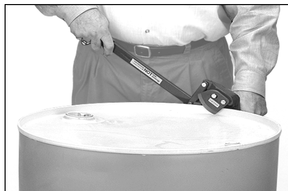
Step 4 – Figure 4