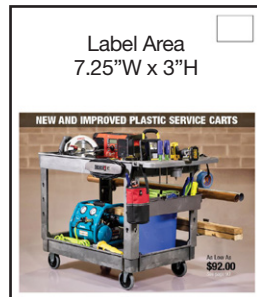
(Back Cover Shown)