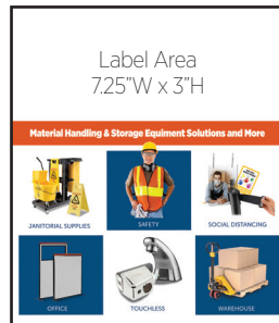
(Back Cover Shown)

NEW in 2021: Products in catalog will not display prices.