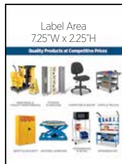
(Back Cover Shown)

Products in catalog will not display prices.