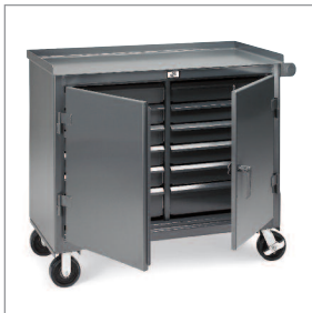
Heavy-Duty Mobile Tool Cart