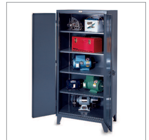
Ultra-Capacity Lifetime Cabinet