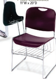
MODEL 8508 W/TAB5R AND BR85 The 8500 Series chair with the optional R/L Tablet and Book Rack