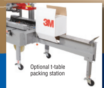
Optional t-table packing station