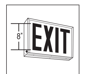
Letters 8" high with 1" stroke, with 100 ft viewing distance rating, based upon UL924 standards meets New York City requirements.

The typical life of the exit LED lamp is 10 years.