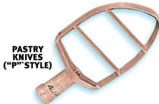
PASTRY KNIVES ("P" STYLE)

* indicates a brass insert for longer life