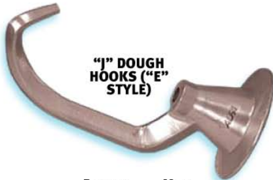
"J" DOUGH HOOKS ("E" STYLE)

* indicates a brass insert for longer life