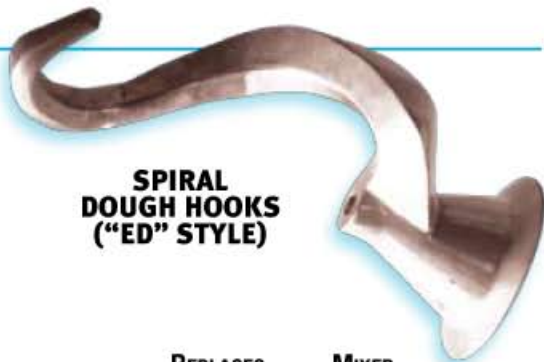
SPIRAL DOUGH HOOKS ("ED" STYLE)