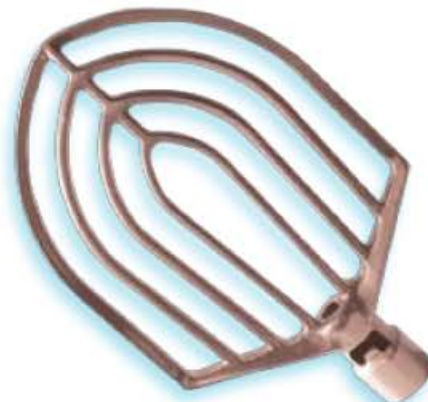
FLAT BEATERS or PADDLES ("B" STYLE)