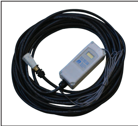
Digital Thermostat (with 50' cord) Set Point Range: -30°F - 220°F Differential Range: 1° - 30°F #ACC-DIGTHIDF