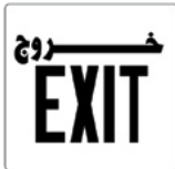
SW65 (Makhraj Arabic)

Dual-Lite's cast-aluminum SE Series exit signs feature an option for custom or standard special-wording. The images below represent a sample of standard special-worded signs available. A comprehensive list of all standard special-wording signs is shown on the next page. Because the artwork and silk-screening for these signs were previously developed, pricing for these standard special-worded signs do not incur a setup charge. If your special-worded requirements do not show up on this list, please contact the factory to request your custom special-worded sign. Custom special-worded signs will incur a one time setup charge for each development.