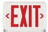
EVC Combo Exit/ Light