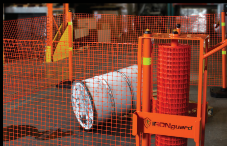
SECURE A TEMPORARY HAZARDOUS AREA