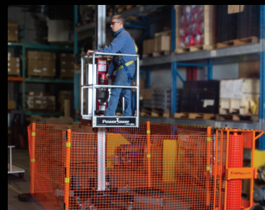
PROTECT MAINTENANCE AND SERVICE PERSONNEL