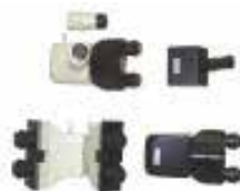
Four Head Choices