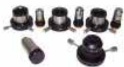
Phase and Dark Field

The LW Scientific Revelation III microscope is our best-selling medical-grade compound microscope, popular in physician and veterinary offices as well as universities and medical schools. Its crisp optics, sturdy design and proven track record make the Revelation III the best choice for superior performance at an economical price. The Revelation 3 microscope is intended for use as a biological microscope in a professional environment in accordance with the guidelines set forth in this operations manual.