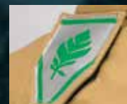
"Easy Grip" Drag Rescue Device