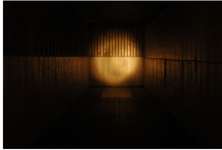
This particular snapshot shows the comparable Larson Electronics LE-224 Halogen flashlight. Notice the halogen is less bright and more yellowish.