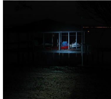
Illumination of the EXP-LED-F4W at 225 feet. This LED flashlight meets the highest safety ratings for hazardous locations at a price below $50. However, this flashlight still delivers a strong beam to 250 feet.