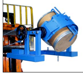
Forklift-Karrier with 55/30-16