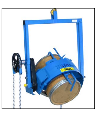
Kontrol-Karrier with Model 55/30-16

Diameter Adaptors are made in 1.5" (3 cm) diameter increments for common drum sizes.