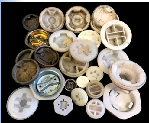
Each Mose drum wrench fits many different bungs

Same generous size and universal pattern as Model 59 but made of zinc aluminum alloy to be spark resistant.* Natural bright silver color. This alloy was selected for its high strength, toughness and economy.