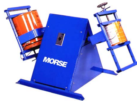
Model 2-305-1 shown