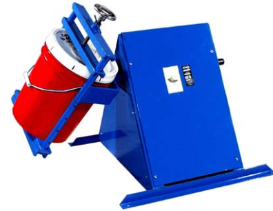
Model 1-305-1 shown