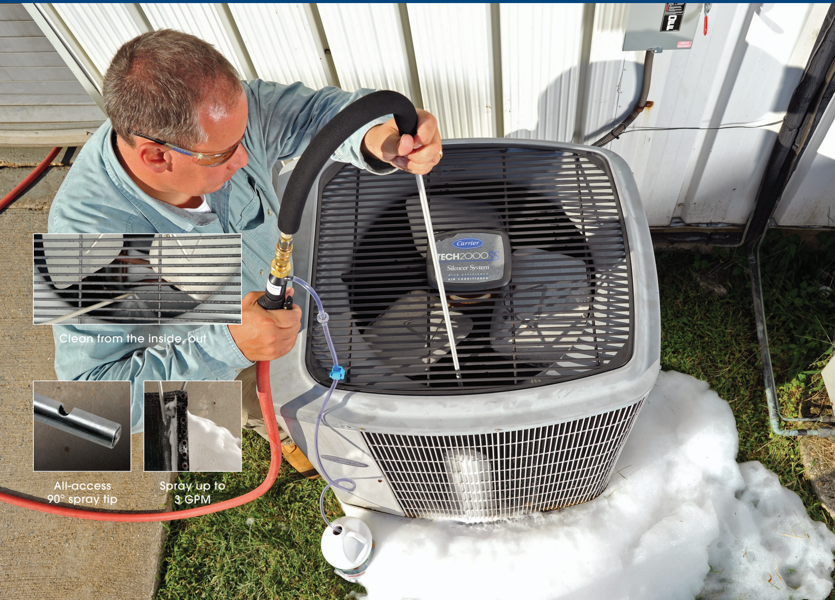
Clean from the inside, out

Simply attach to a standard water hose and deliver a powerful 90° stream of water and chemical cleaner - up to 3 gallons per minute. It also includes an adjustable chemical injection hose for use with SpeedyFoam™, an acid free, foaming coil cleaning solution that works great. Now that's smart.