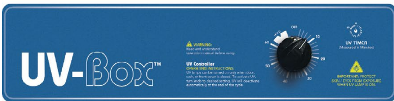
UV timer permits user to set decontamination time and cycle, or to hold operation.