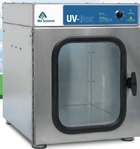
— Model UVB-15