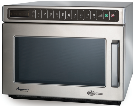
Model HDC182 shown