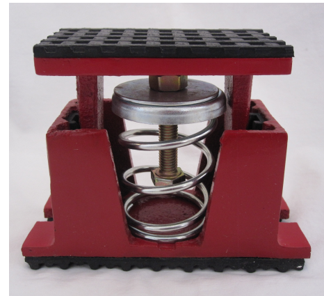
XN-100 (Neoprene Top)

Above products are standard in BLUE, but can also be available in red (custom order)