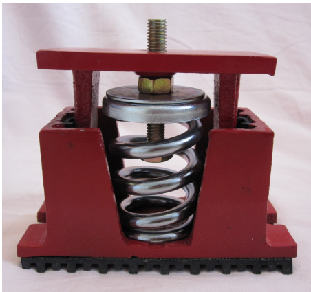
XP – 1 (Pin Top)