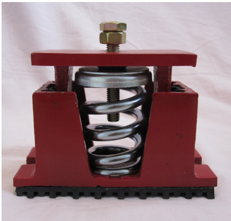
XE – 100 (Bolt Top)

Type "X-100" series Spring Mounts with one inch deflection solve troublesome vibration problems. These mounts are preferred over most rubber mounts due to the greater static deflection of the spring. "X-100" series spring mounts are designed for noise and vibration control applications in critical areas on concrete and wooden floors.