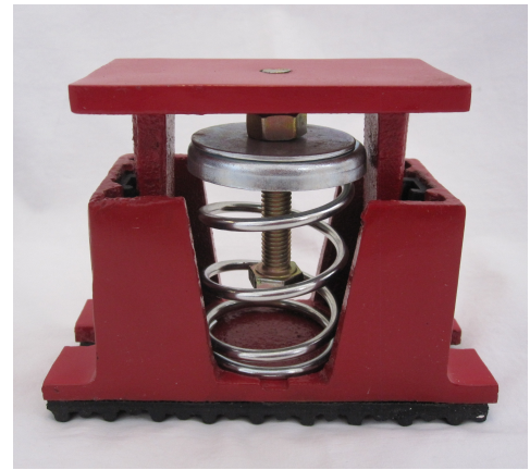
XF – 100 (Flat Top)