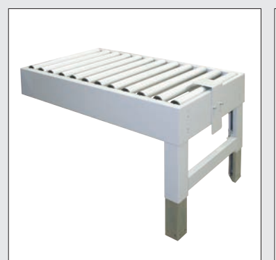
Long Infeed/Exit Conveyor w/ L-Bracket Stabilizer