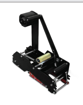
Spare Tape Head