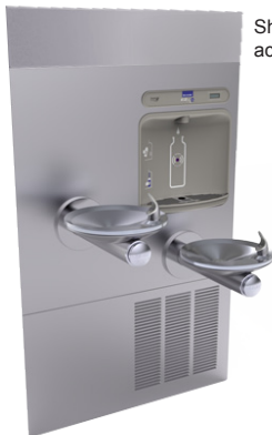
Shown with one optional access panel installed