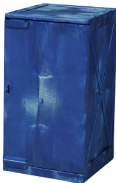
Model M12CRA 12 Gallon Modular Cabinet