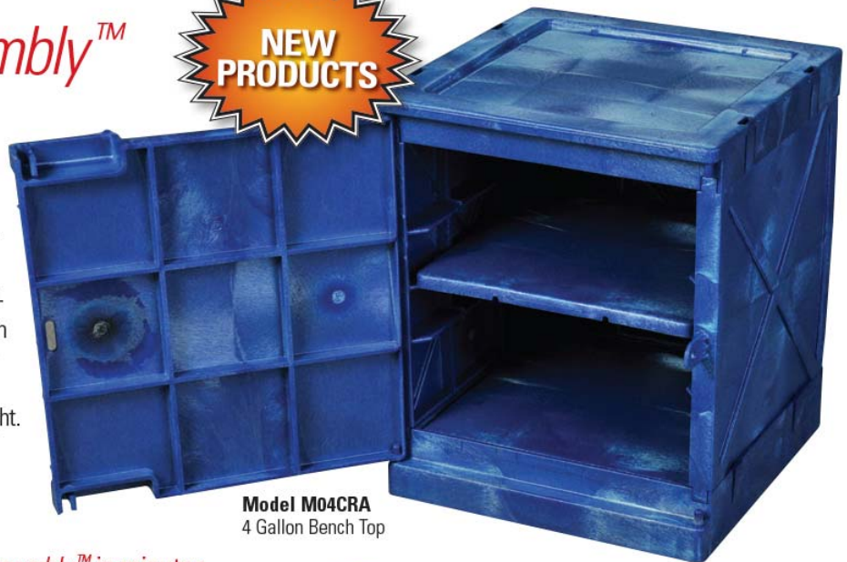
Model M04CRA 4 Gallon Bench Top