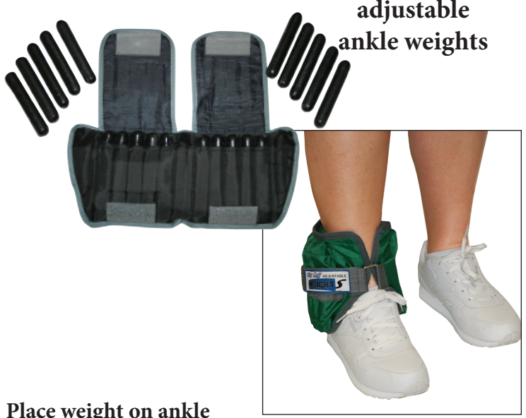
adjustable ankle weights

Place weight on ankle ✓ Same as above with additional instructions ✓ Place ankle weight so that open portion is in front and ankle cut-out is in rear with "this side up" in rear pointing up