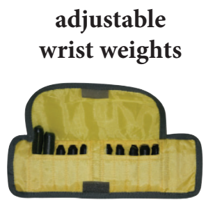
adjustable wrist weights

Place weight on wrist, arm or thigh ✓ Place loop of long strap over hook on shell (opposite side from metal D-ring) ✓ Place weight on body part and thread strap through D-ring ✓ Cinch (pull tight) the strap to give the weight a snug fit and fasten strap with hook/loop for secure closure