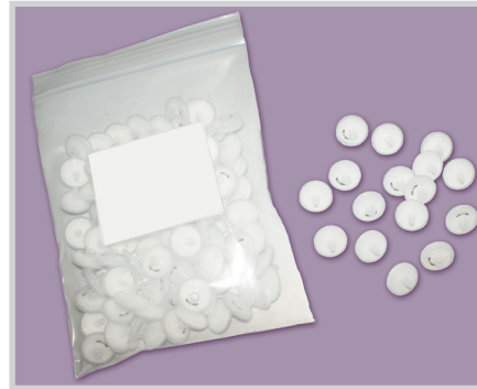
Non-sterile product is polybagged.