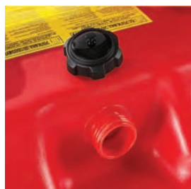
Fill Spout and Cap The 2" fill spout makes refilling the Gas & Go easy. The vented cap keeps the tank closed and provides pressure relief when required.