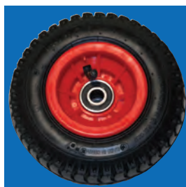
8" Pneumatic Tires The pneumatic tire & plastic wheels make it easy to move the Gas & Go on any surface.