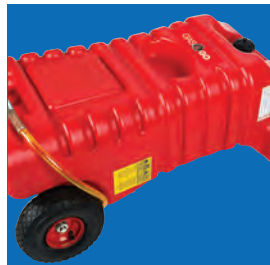
"Lay Flat" Design The handle also serves as a secure rest when the caddy is being transported on its back.