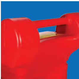
Molded Handle The molded handle is designed for comfort and balance when transporting.