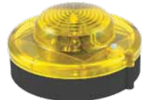
Model # 911Y Yellow