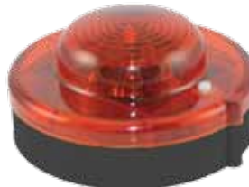
Model # 911R Red