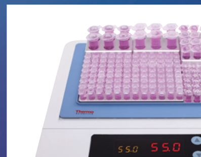
Compact Dry Bath / Block Heater pg 6