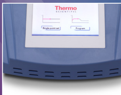
Touch Screen Dry Bath / Block Heater pg 4