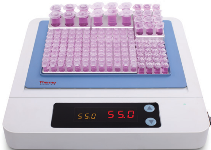
Small footprint and lightweight