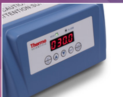
Digital Dry Bath / Block Heater pg 3

Available with digital or touch screen controls, our units provide outstanding temperature uniformity and stability that help create the reproducible results that you need.