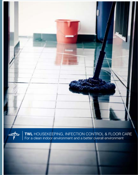
TWL Housekeeping, Infection Control & Floor Care