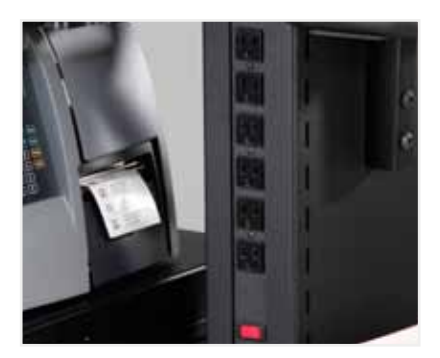
Integrated power strip