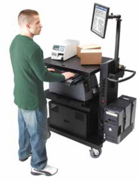
PC Series Workstation shown above is a 30" (762 mm) deep unit with optional accessories.

A number of optional accessories are available and can be easily integrated in seconds for a highly versatile workstation.