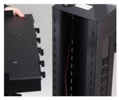
Fully adjustable shelves with slotted mast