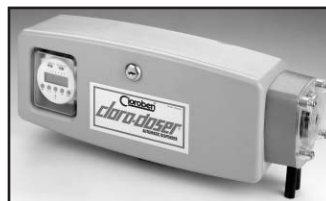
PT-4 can be automatically dispensed into drains and septic systems using the Cloro-Doser® . (See Cloro-Doser Spec Sheet #S01005)