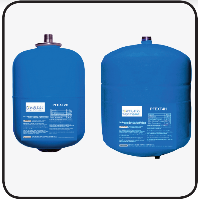
Expansion Tanks 1/2" NPT Connection