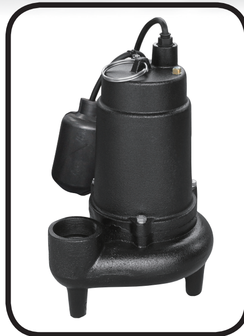
Submersible Sewage Pump 2" Discharge, 2" Spherical Solids Wide Angle Tethered Float