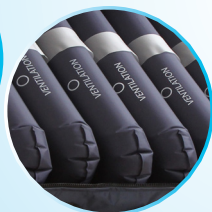
Low Air Loss