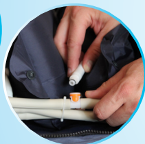
Easy Valve Exchange