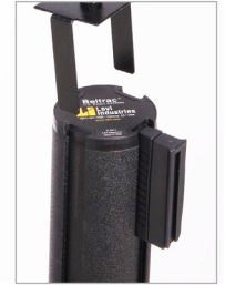
Adapters to Fit All Major Brands