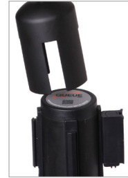
Easy Fit Post Top Adapters