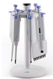
Carousel Pipettor Stand

Tip ejector allows ..... convenient one-handed operation