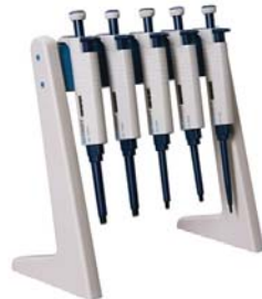
Linear Pipettor Stand