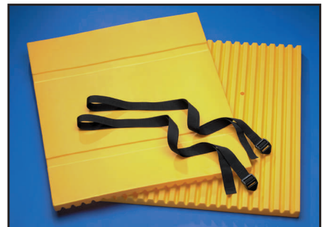
Protected with Concrete Wrap

Each Concrete Wrap kit includes: two-44" wide blankets and two locking cinch straps, enough to cover a 24" diameter concrete base.