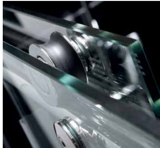
PREMIUM 3/8" THICK TEMPERED GLASS