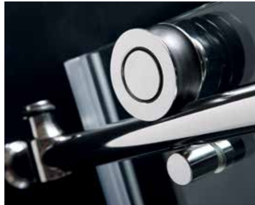
STAINLESS STEEL WHEEL ASSEMBLY